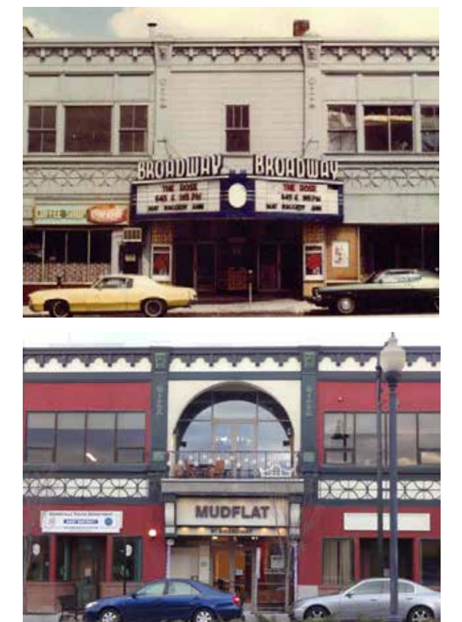
PAGE LEFT: Public Reception for Centenary Exhibition TOP LEFT: The former Broadway Theatre BOTTOM LEFT: Facade of Mudflat today