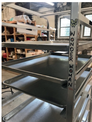
(this is the Wonder Woman cart)

1. When your piece is ready to be fired, find the appropriate cart ( i.e. greenware , reduction glaze etc.) and put your piece on a shelf. Every cart is labelled with an alphabet letter, a super hero, or Mario brothers character. Record the date, the cart you put it on, and what the piece looks like in your notebook. In Two weeks, you should start looking for your piece(s) on the long carts.